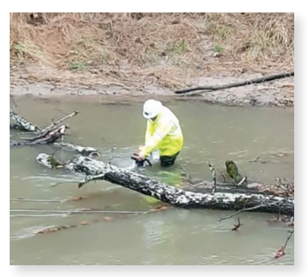
Extreme conditions require extreme measures.

eeping our rights of way clear is a big part of keeping the lights on for our members. In December, Amicalola EMC contracted with Agriculture Air Services to trim the right of way along Highway 108 and part of Highway 20 by helicopter. These helicopters are equipped with aerial saw blades that can trim trees in hard-to-reach areas. The work done by helicopter and completed in two weeks could have taken two months if done by hand.