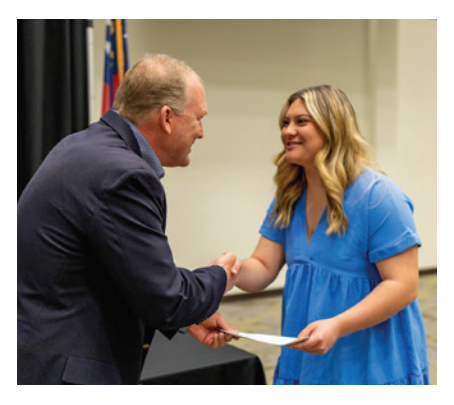
$1,000 each was awarded to 136 high school seniors at the youth awards banquet.