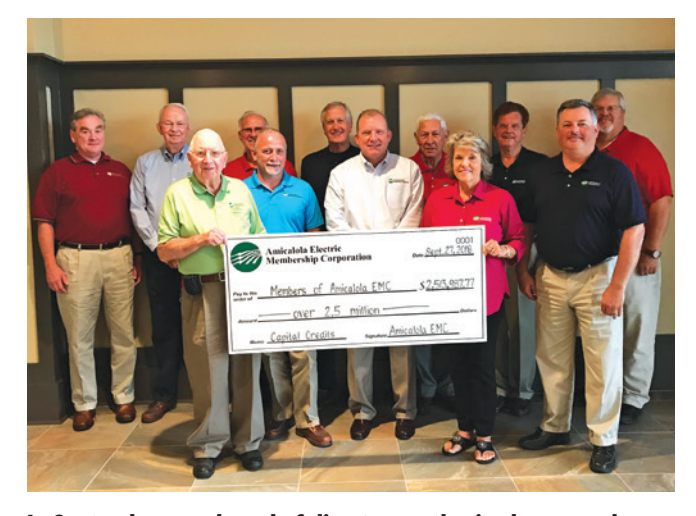
In September, our board of directors authorized a general refund of capital credits in the amount of $2.5 million for members who had service during the year 2000.

We are extremely proud of our Operation Round Up (ORU) program, which hit $2.3 million in donations this