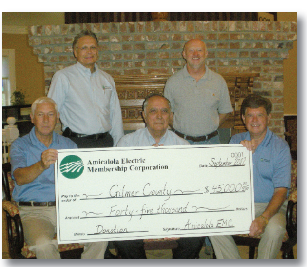
Gilmer County Commissioners - $45,000