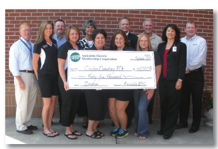
The Clayton Elementary School PTA - $45,000