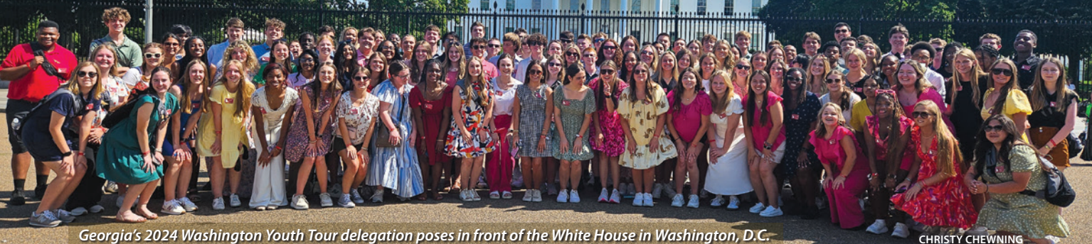
Georgia's 2024 Washington Youth Tour delegation poses in front of the White House in Washington, D.C.