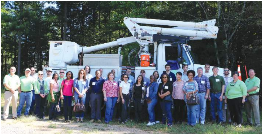
Attendees at the orientation at Amicalola EMC

A micalola EMC recently hosted an orientation for a group of employees from Georgia Transmission Corp., Georgia System Operations Corp. and Oglethorpe Power Corp. Attendees were both new and tenured employees who wanted to learn more about electric coopera-