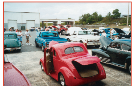
Last year's car show drew a large crowd, and even more are expected this year.